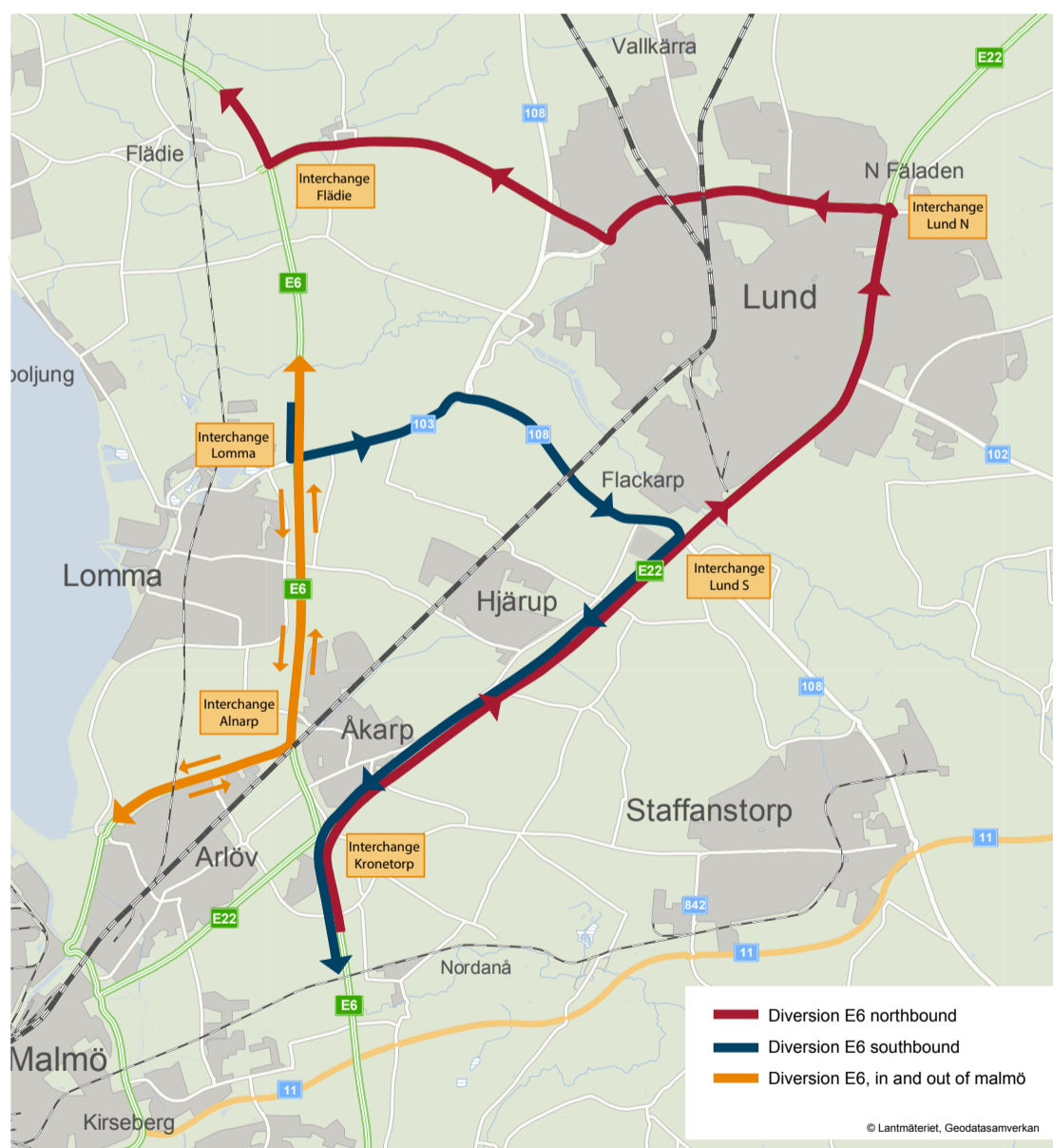
Routes to bypass the shutdown

Reconstruction work of the railway tracks between Malmö and Lund began in autumn 2017. The two existing tracks will become four, increasing capacity on the route and reducing disruptions to train traffic.